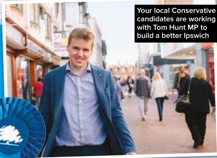
Your local Conservative candidates are working with Tom Hunt MP to build a better Ipswich

So we can work together to deliver the joined-up plan that our community needs. A vote for anyone else risks politicians arguing, more delay and no action on local issues.