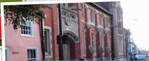
FIND OUT MORE AT suffolkconservatives.org.uk

Conservatives are committed to our libraries and Suffolk is one of the few local authorities not to close any. The service has gone from strength to strength and they are seen as very much at the heart of the community providing innovative services, training and outreach that has been particularly valuable during COVID.