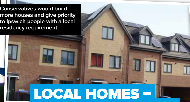
Conservatives would build more houses and give priority to Ipswich people with a local residency requirement

Ipswich Conservatives would inject a business-like approach to everything the Council does & work towards making Ipswich a place we can be proud of with services fit for the changes we will all face in the coming years.