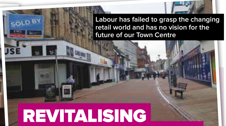
Labour has failed to grasp the changing retail world and has no vision for the future of our Town Centre

Conservatives will reverse this trend & work closer with developers to meet the housing needs of Ipswich people. This must include aspirational private housing alongside affordable homes for those most in need of somewhere safe & secure to live.