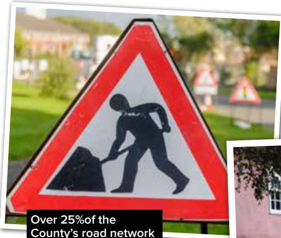
Over 25% of the County's road network has been resurfaced in the last 4 years.

£21 million pounds has been invested in the last four years resurfacing over 25% of the road network throughout the County.