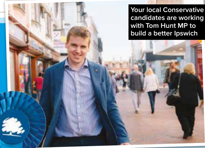
Your local Conservative candidates are working with Tom Hunt MP to build a better Ipswich

So we can work together to deliver the joined-up plan that our community needs. A vote for anyone else risks politicians arguing, more delay and no action on local issues.